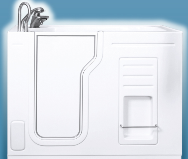
Model IS-5129 Inswing Door 51 \frac{1}{4} " x 29 \frac{3}{4} " x 37 \frac{1}{2} "