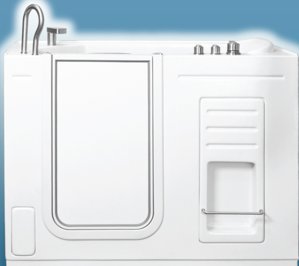
Model IE-5129 Inswing Door 51 \frac{1}{4} " x 29 \frac{3}{4} " x 37 \frac{1}{2} "