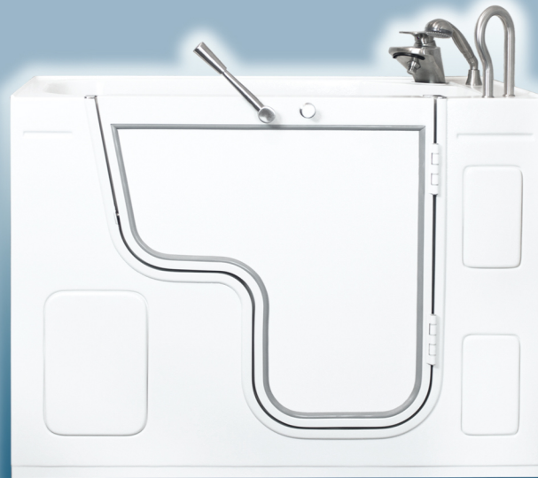
Model OH-5129 Outswing Door 51 \frac{1}{4} " x 29 \frac{3}{4} " x 37 \frac{1}{2} "

Whatever your needs, we have the best walk-in tub for you.