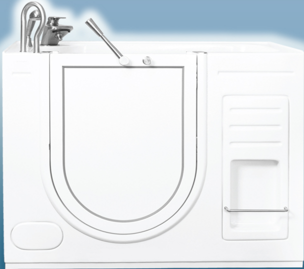
Model OS-5129 Outswing Door 51 \frac{1}{4} " x 29 \frac{3}{4} " x 37 \frac{1}{2} " Model OS-5126 Outswing Door 51 \frac{1}{4} " x 26" x 37 \frac{1}{2} " Model OS-4829 Outswing Door 47 \frac{5}{8} " x 29 \frac{3}{4} " x 37 \frac{1}{2} "

Whatever your needs, we have the best walk-in tub for you.